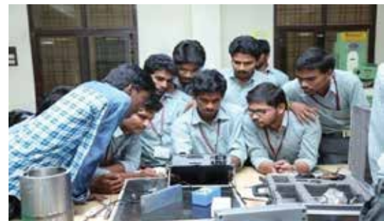
Live Practical Training in Industry