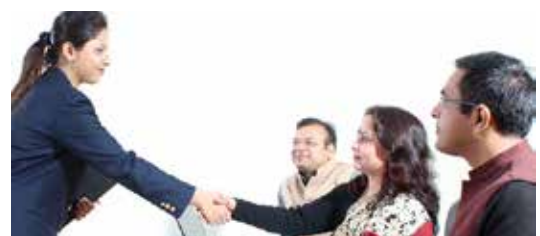
Placements in India & Abroad