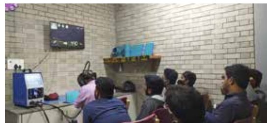
Advanced Welding Training