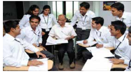
Experienced Industry Faculty