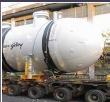
Process Equipments & Heavy