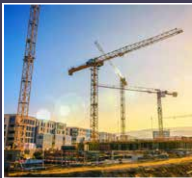
Construction & EPC