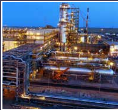
Oil & Gas Industry