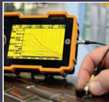
NDT & Adv.NDT Inspection