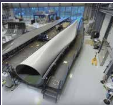
Wind Energy Industries