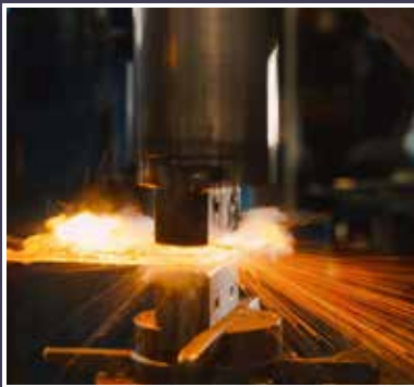
Casting & Forging Industry