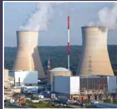
Thermal Power Plants