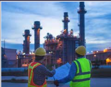
Third Party Inspector