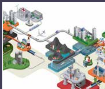
Isometric & Industrial