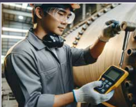
Pressure Vessel / Tank Inspector